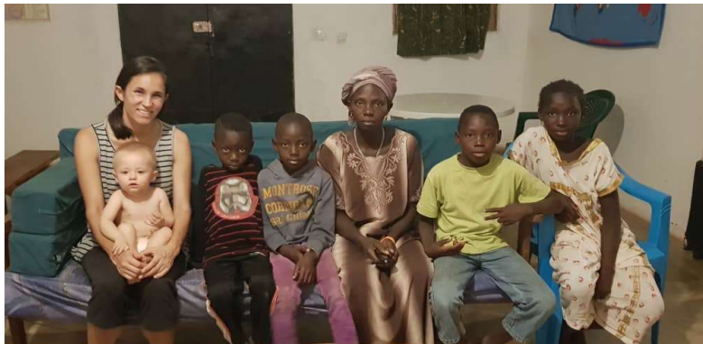
Our neighbors came over to say goodbye.