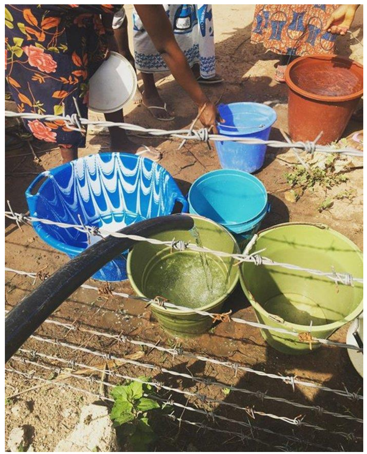
The Hope Remembered NGO served the community in times of water shortage, before the rains, providing through the pump and the well. The Mission 's schools remained closed by order of the government and public church services resumed with specific rules. This year the mission