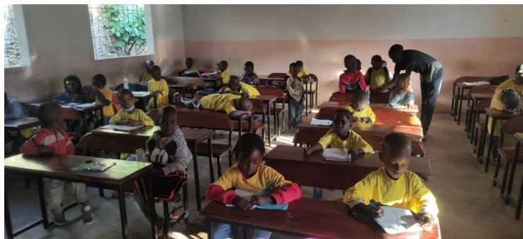
The kids are already enjoying the first set of desks that we were able to purchase.