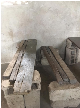
These are makeshift desks that the kids have been using at the school in Guinea Bissau.

We were excited to see that the gardeners have kept the community garden going on their own. We hope to upgrade the water supply and cut down some trees to allow more sunlight to get to the garden before the spring gardening season starts