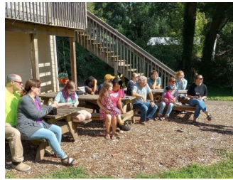
Tree planting ceremony to honor our colleague that passed away.